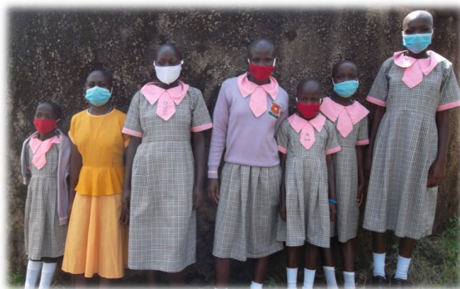
Our girls at their new boarding school - first day.

Many people are wearing masks. Some are not but if they are caught they are asked to pay a fine. Observing social distance is a challenge especially on public transport and public places eg churches, schools etc (Homabay County where we are is the third highest affected area in the country). All markets are open and people are advised to adhere to Covid 19 restrictions - wearing masks, washing hands regularly and keeping social distance. Government, Chiefs, church leaders and school principals have played an important role in educating people to protect themselves and all their loved ones so that everyone can be safe.