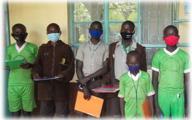
Our boys at their new boarding school.

We have experienced heavy rains in the country. Many people were affected by floods and had to move to higher grounds. Currently the rains have subsided and some schools that were affected have resumed learning in their various institutions. Some people are doing second weeding and top dressing as they look forward for the harvest. Since the children are no longer staying at NDH we continue with our agriculture to get some yields to take to our children during visitation. Covid-19 has challenged us to improve our agriculture and we now raise rabbits and chickens to provide our children with protein.